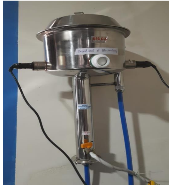
DISTILLED WATER AAPPARATUS