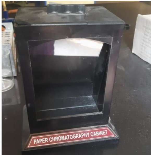
PAPER CHROMATOGRAPHY CHAMBER