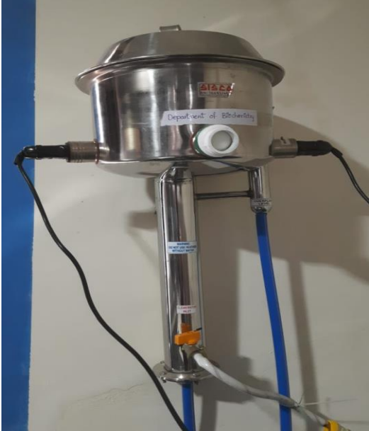
DISTILLED WATER APPARATUS