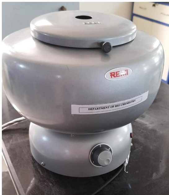
TABLE TOP CENTRIFUGE