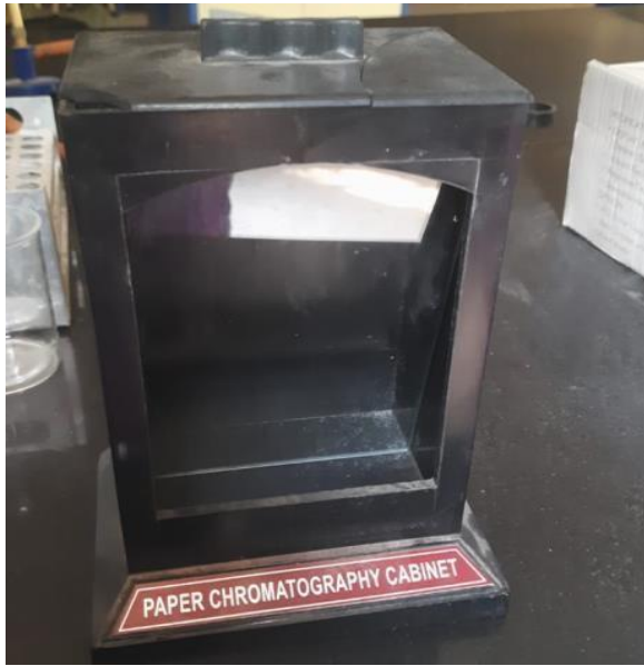
PAPER CHROMATOGRAPHY CHAMBER